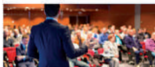
TABLEAUX RÉSUMANT LES PROCHAINS PRINCIPAUX CONGRÈS