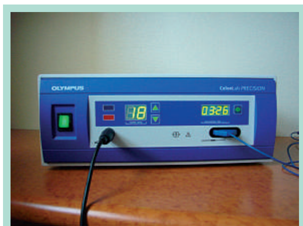
FIGURE 2 : RFITT® unit. Visible settings: power (watts) and duration of application (minutes and seconds in total).

During the procedure, the tissue impedance of the vein, is checked constantly by the unit, and where appropriate, the power (P) output is automatically reduced, with a resulting change to the acoustic signal ( Figure 2 ).