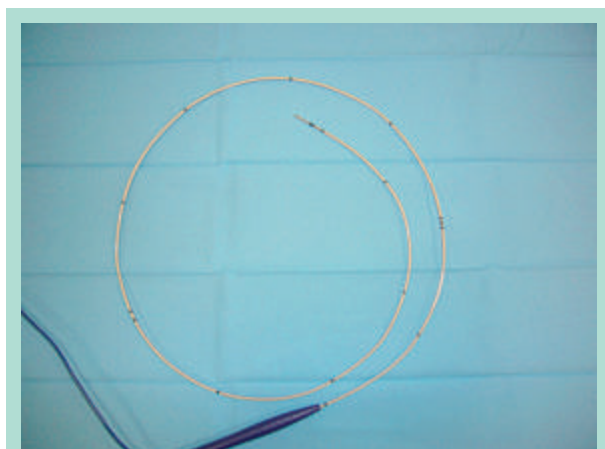
FIGURE 1 : RFITT® applicator, with bipolar active tip (length of bipolar tip = 13 mm); marks on the applicator every 10 cm.