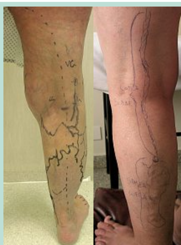
FIGURE 5 : Left: clinical preoperative manifestation showing varicose veins of the sciatic nerve, accompanied by insufficient small saphenous vein and post-axial vein. Right: varicose veins of the sciatic nerve. The upper section is sub-aponeurotic and the lower section is supra-aponeurotic.

Interestingly there is no further description of varicose veins in the internal popliteal sciatic nerve, probably due to the permanent depth at which this nerve is in the leg.