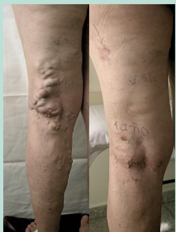
FIGURE 13 : Varicose veins of the sciatic nerve. Pre and postoperative of 1 year.