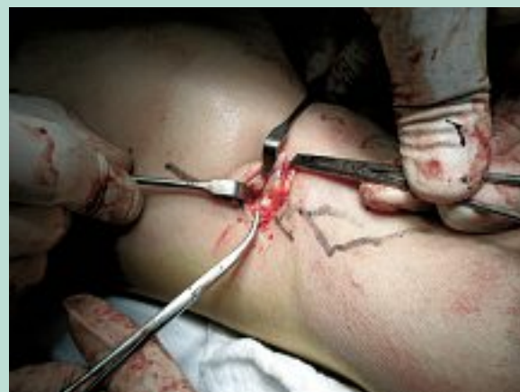
FIGURE 8 : Varicose veins of the sciatic nerve separated from the nerve.

In addition, as highlighted by Nicos Labropoulos [6] the vein may take the form of perinervous plexus even within or closely related to the epineurium, which would cause an inflammatory reaction of the nerve of varied magnitude and duration.