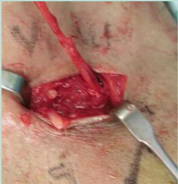
FIGURE 10 : Left small saphenous vein and right varicose veins of the sciatic nerve.