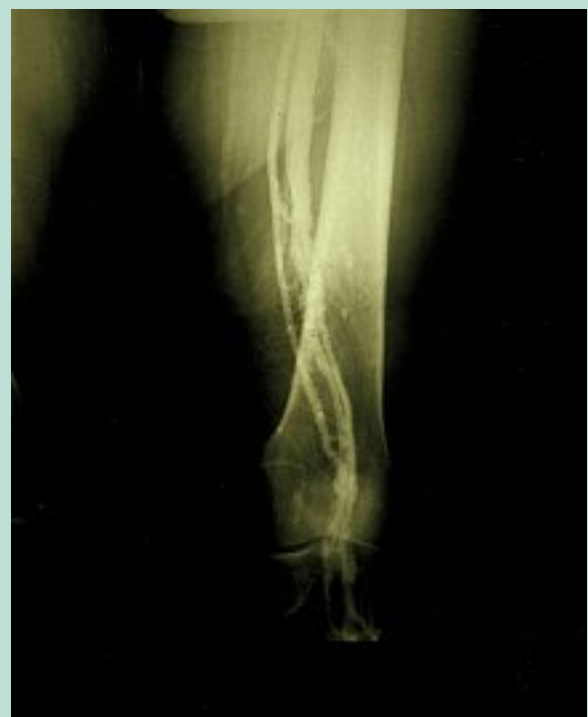
FIGURE 3 : Ascending phlebography, showing satellite vein of superficial femoral vein, in post-thrombotic syndromes.