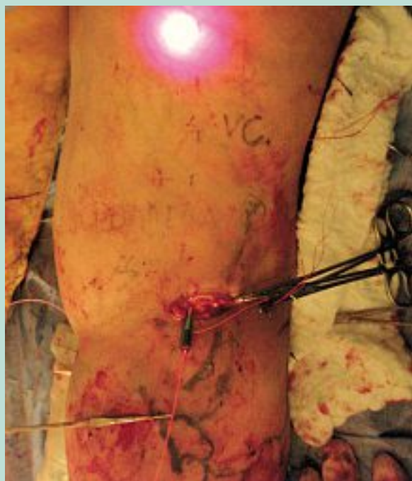
FIGURE 7 : Endovascular laser treatment of post-axial vein. On the right the vein of the sciatic nerve can be observed.

According P. Lemasle [2, 4] these findings are pathognomonic, being the Doppler ultrasound more than enough to complete the diagnosis.