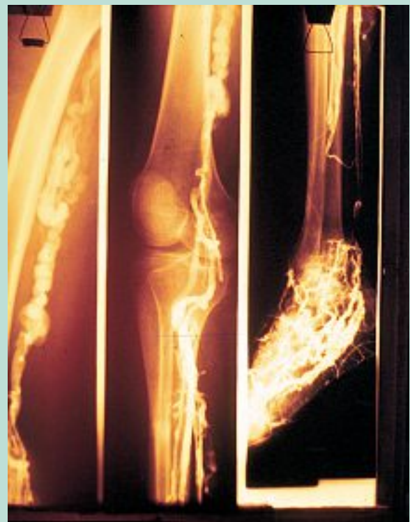
FIGURE 2 : Klippel-Trenaunay syndrome. Ascending phlebography, image showing the left and continuing embryonic persistence of the sciatic vein.

These varicose veins due to reflux of peri-nervous veins appear dilated and become detectable with Doppler ultrasound, fact that does not normally happen.