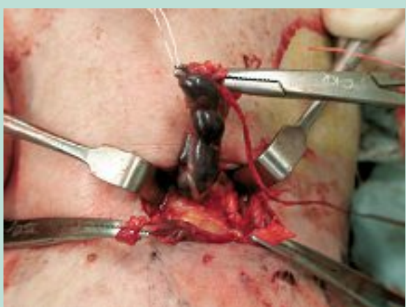
FIGURE 11 : Extirpation of sciatic vein.

Care must be taken in the therapy of the branch around the fibular head to avoid injury to the peroneal sheath of the external popliteal sciatic.