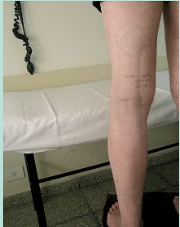
FIGURE 12 : Postoperative of 10 months.

Facing reflux as consequence of insufficiency of inferior ischial or gluteal veins a selective embolization according to the magnitude can be proposed.