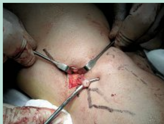
FIGURE 9 : Varicose veins of the sciatic nerve. On the right small saphenous vein marked.

Also in the tibial nerve veins, as continuation of the internal sciatic popliteal, sclerotherapy is risky in the area that lies between the external saphenous and the popliteal vein, either by direct injury or inflammatory spread.