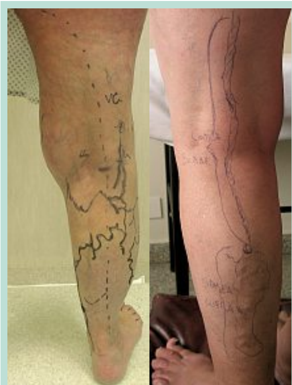
FIGURE 5 : Left: clinical preoperative manifestation showing varicose veins of the sciatic nerve, accompanied by insufficient small saphenous vein and post-axial vein. Right: varicose veins of the sciatic nerve. The upper section is sub-aponeurotic and the lower section is supra-aponeurotic.

Interestingly there is no further description of varicose veins in the internal popliteal sciatic nerve, probably due to the permanent depth at which this nerve is in the leg.