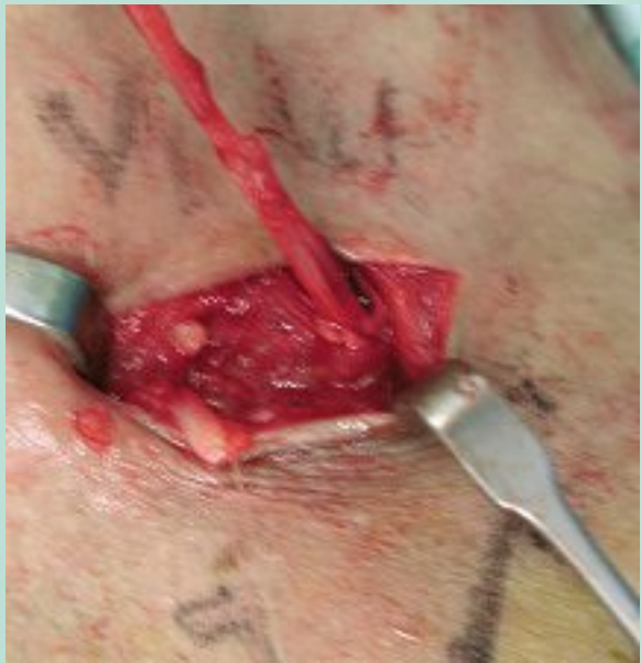
FIGURE 10 : Left small saphenous vein and right varicose veins of the sciatic nerve.