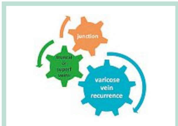
FIGURE 5 : Joint venture between phenomena at the saphenofemoral or saphenopopliteal junction and truncal or superficial veins in the periphery may lead to clinically relevant varicose vein recurrence.