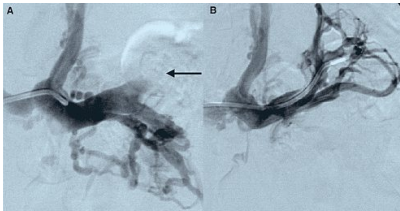
Fig. 2. – Renal Vein Thrombosis. Selective venogram of the left renal vein reveals an acute thrombotic occlusion of the upper pole venous segment (arrow) with stenosis of the central segment and collateral drainage via the adrenal vein (Fig. 2A). Recanalization of the venous occlusion was accomplished with interventional therapy (Fig. 2B)

These clinical observations seem to indicate that patients with RVT should be treated with heparin and warfarin, that warfarin needs to be continue for at least 6 months, but some recommend anticoagulation