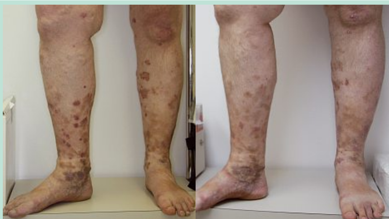
FIGURE 2 : Before and 3 months after endovenous laser ablation of both GSV's. There is significant reduction in symptoms, erythema and psoriatic plaques.