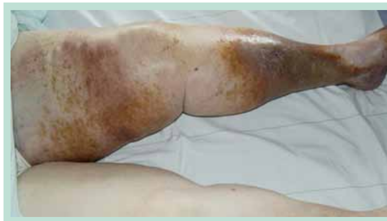
FIGURE 1 : Swollen left leg to the groin with pitting and non-pitting oedema, hyperpigmentations and with two indurated painful erythematous lesions. Painful palpation. Stemmer's sign was positive on the left foot.

Physical examination revealed a large swollen left leg to the groin with pitting and non-pitting oedema, with two indurated painful erythematous lesions. Stemmer's sign was positive on the left foot ( Figure 1 ). A phlebogram revealed a deep venous thrombosis of the popliteal- and femoral vein with drainage via the superficial veins. Angiography revealed an arteriovenous (AV) malformation in the left groin, fed by branches of the left external iliac artery. There was significant arteriovenous shunting resulting in reversal of the flow in the left femoral vein ( Figure 2 ).